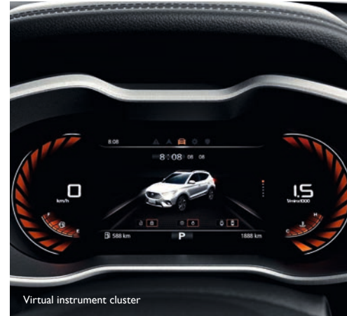
Virtual instrument cluster

Includes Apple CarPlay™ and Android Auto™ functionality.