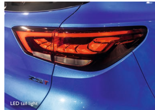
LED tail light