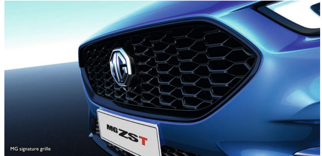
MG signature grille

It all comes down to creating the ultimate in-car experience: With Sat Nav as standard, and 5 USB ports – two in the front, two in the rear for backseat passengers and one conveniently mounted on the rear-view mirror for your dash cam. – it all comes together in the MG ZST.