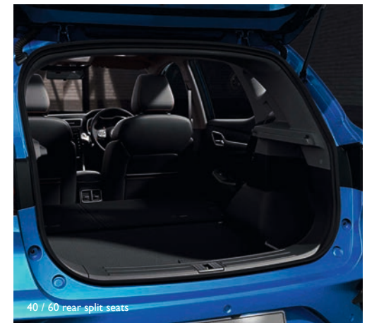
40 / 60 rear split seats