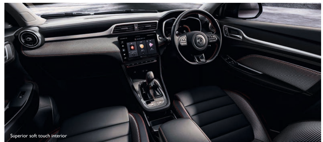
Superior soft touch interior