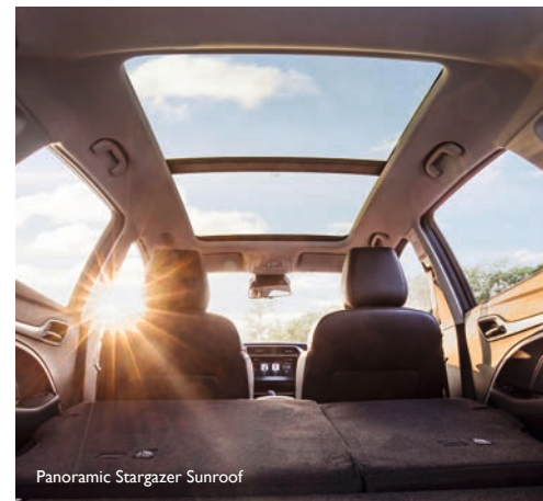
Panoramic Stargazer Sunroof