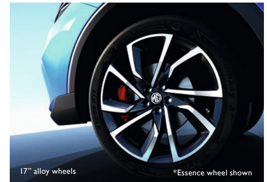
17" alloy wheels