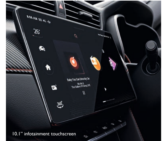
10.1" infotainment touchscreen